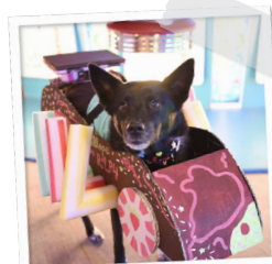
Toothless the Puppy