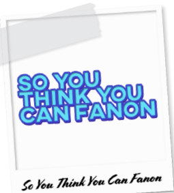
So You Think You Can Fanon

So You Think You Can Fanon is a group of friends who banded together to host the fandom- and fiction-centric podcast of the same name. We cover all sorts of fan work and even discuss some of our own thoughts on writing certain topics. What started as just bad fanfiction reading blossomed into a diverse range of both education and hilarity. Whether it's making you laugh with our unique sense of humor or breaking your brain as we deconstruct your favorite piece of fiction, you truly never know what you'll get when you come to one of our panels.